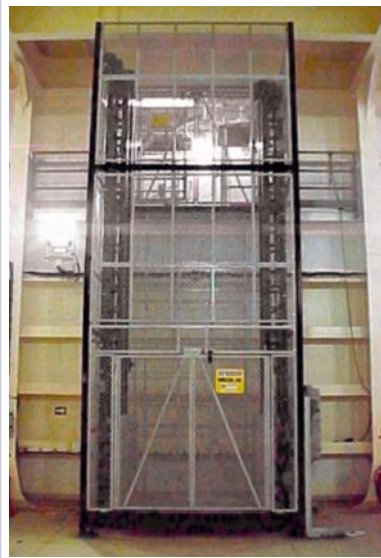
LOW OVERHEAD SPACE