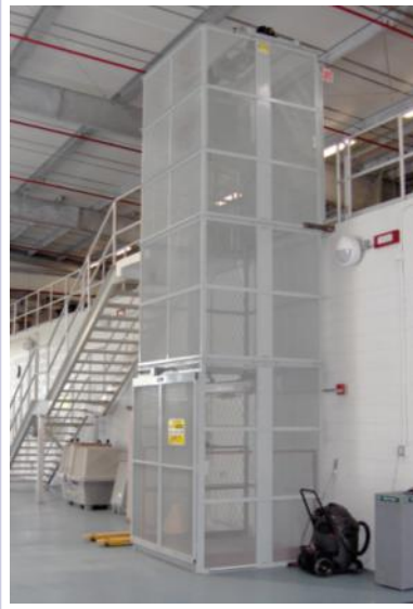
EASY & ECONOMICAL