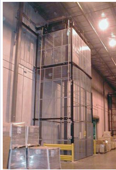
HEAVY DUTY LOADS